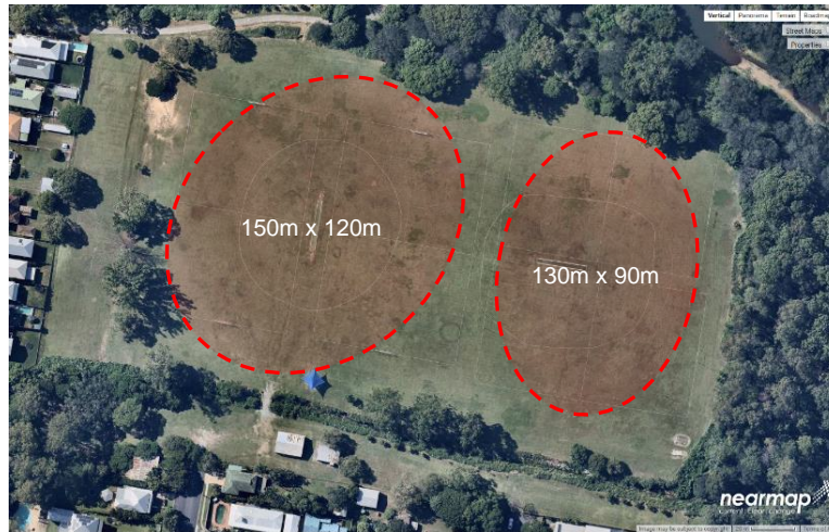
AFL Playing Fields